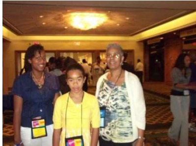
Jr. Convention, New Orleans 2011