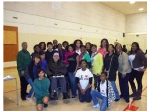
EYL with Veterans on MLK