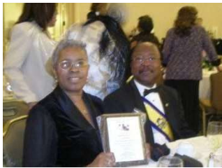
Knights of Peter Claver Area Deputy Award 2010