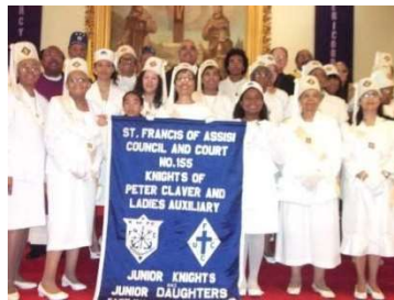
St. Francis of Assisi Ct. & CN 155