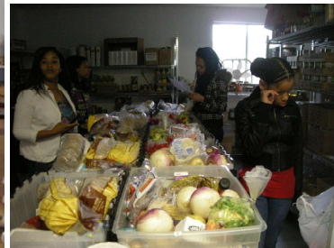
St. Francis of Assisi Juniors #155 helping the St. Vincent de Paul Society