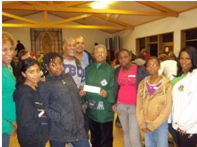
Christmas Baskets at St. Francis

DESCRIBE OUTSTANDING OR NOTEWORTHY SERVICE TO THE CHURCH. (Activities, offices held programs developed for parish, programs lead for CHURCH PARISH, PROGRAMS LEAD FOR THE Dioceses, OUTSTANDING church/parish/dioceses RECOGNITIONS, CONTRIBUTIONS TO THE church, parish, dioceses--papal medals, etc. Parish organizations involved in, major contributions/donations made to the church or parish or dioceses, major programs created or lead or participated in for the church/dioceses, etc. including Philanthropic endeavors—i.e. donations/gifts to CHURCH, etc)